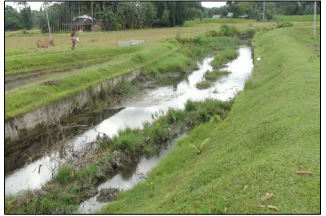
Worksite of AAP No. 0704157393/2013-14