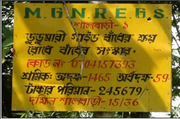
Display Board of AAP No. 0704157393/2013-14