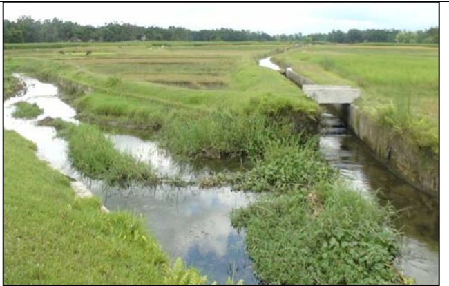
Work done by the irrigation department near the worksite of AAP No. 0704157393/2013-14