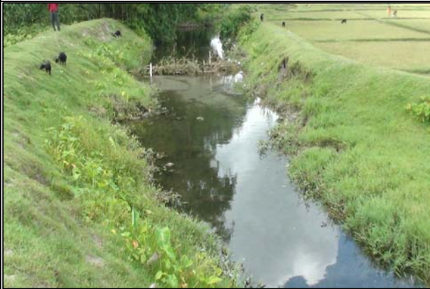
Worksite of AAP No. 0704157393/2013-14